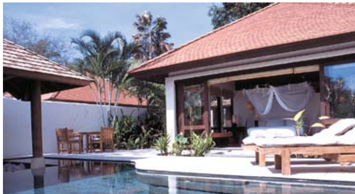
Evason Pool Villa

The new sundeck wing has become a resort within a resort. It comprises 16 Duplex Pool Suites and 10 Junior Suites, with spectacular views from all suites, plus butler service. It is ideal for families, friends and couples alike. The wing has its own reception, business centre and library with computers. Internet wireless connection is free of charge for those with their own laptops. There is a fitness centre, steam room and sauna, pool bar and café, and Just Kids' - a club for youngsters. Into Games is great for teenagers, with a pool table, table tennis, football tables, play station and other games.