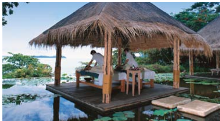
Six Senses Spa

Our luxuriously appointed Six Senses Spa spreads over three floors and sets new standards in spa design. Facilities include 6 single treatment rooms, 2 saunas, 2 steam rooms and 3 double treatment rooms featuring outdoor baths for couples and friends to enjoy. An additional 4 treatment rooms are located in the salas on the spa terrace overlooking the Andaman Sea.