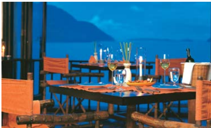
Into The View