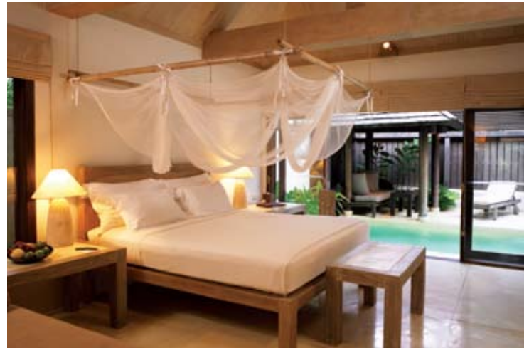
Evason Pool Villa

The Evason Pool Villas are the first of their kind in Hua Hin. Each villa is secluded by a wall for privacy and has its own private plunge pool, plus an outdoor bathtub in a rustic garden setting surrounded by a lotus pond.