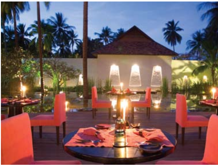
Kieng Sah Restaurant