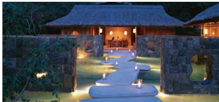
Six Senses Spa

Offers an unrivalled selection of holistic and signature treatments to suit individual needs and preference. For discerning spa goers wanting to try something unique yet traditional, the Vietnamese Experience is available to indulge in. A journey for the senses combined Vietnamese pressure point foot, body and scalp massage finishing with a Vietnamese facial and hair wash. Also available will be the Six Senses Spa Signature treatments offered in all Six Senses Spas. From the soothing holistic massage to the more stimulating Swedish and foot acupressure massage, there is something for everyone, including a selection of facial treatments, manicures and pedicures and waxing treatments. If the choice is simply too great, complimentary consultations will be available to all guests.