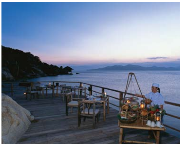
Dining by the Bay

Serving international and local favorites, plus East meets West with fusion specialties. The restaurant opens to the environment, with glass screens that slide into place during inclement weather. The area is cleverly designed on several levels to provide mood changes and transformation of atmosphere throughout the day.