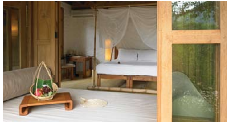
Beach Villa Bedroom