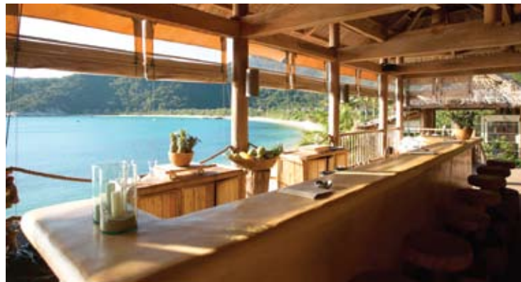
Drinks by the Bay

Beside the restaurant, making the transition from drinks to dining a seamless affair. The Bar remains open until the last guest departs.