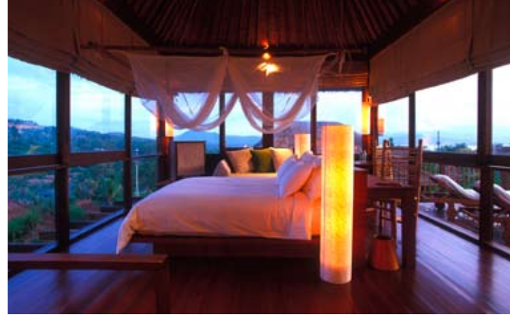
Pool Villa Bedroom