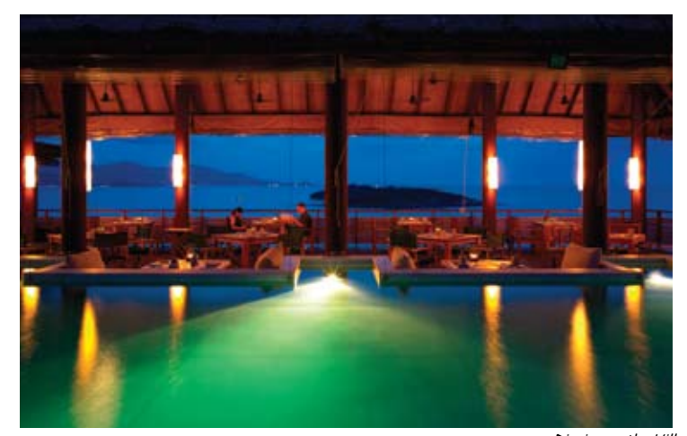
Dinning on the Hill