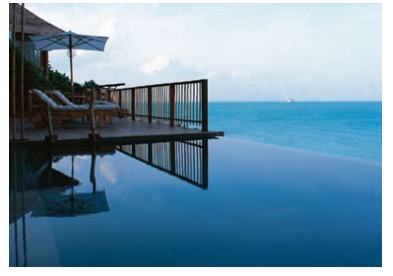
Pool Villa Seaview

Six Senses Hideaway Samui is managed by Six Senses Resorts & Spas, who have developed and operate unique properties in Maldives, Oman, Thailand, Vietnam, Spain, Fiji and Jordan under the brand names Soneva, Six Senses Hideaway, Six Senses Latitude and Evason: plus Six Senses Spas and Six Senses Destination Spas. The Six Senses team has positioned Six Senses Hideaway Samui to incorporate the same brand values and personal service promised in the Six Senses Core Purpose: To create innovative and enriching experiences in a sustainable environment.