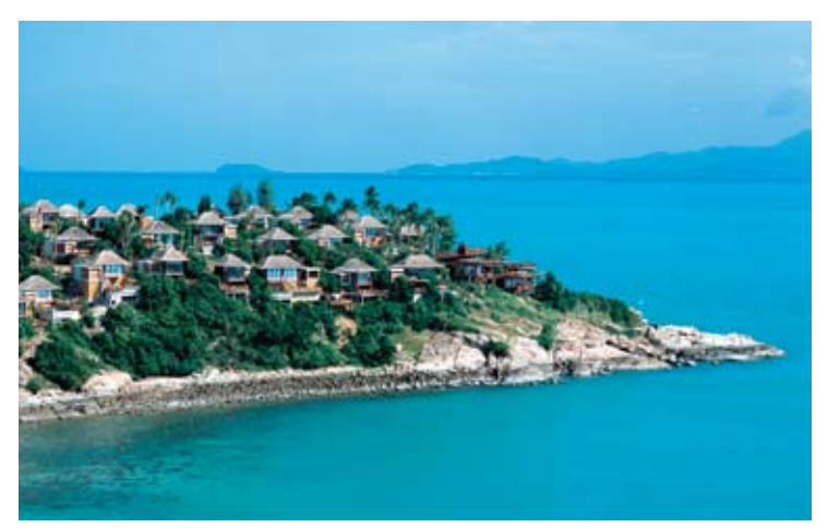
Aerial View of Six Senses Hideaway Samui

Koh Samui is south of Bangkok and east of Phuket, inside the Gulf of Thailand. The island is just 21 kilometres wide and 25 kilometres long and has frequent air services from Bangkok, Phuket, Singapore and Hong Kong. The massive seated Buddha Image known as 'Big Buddha' is just five minutes from the resort.