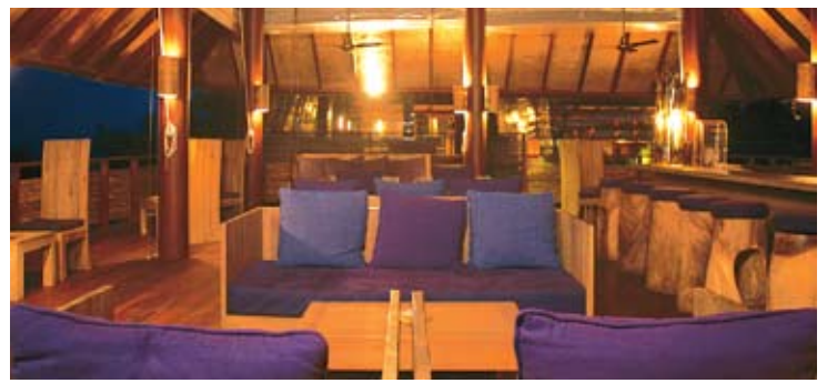
Drinks on the Hill

Drinks on the Hill offers spectacular sunset views whilst listening to live jazz and enjoying a fine selection of frozen cocktails, beers and wines by the glass.