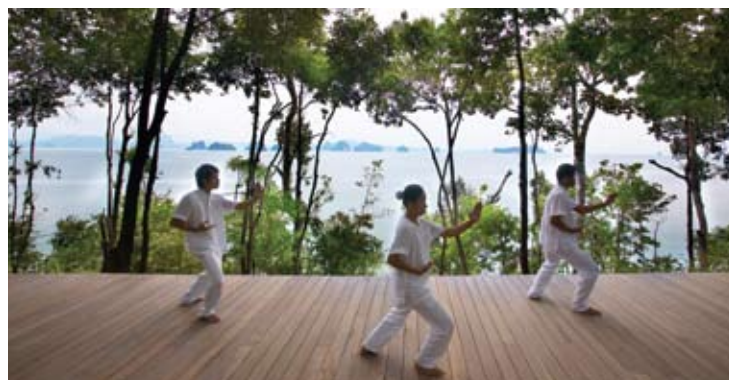
Qi Gong at Six Senses Spa

The Holistic Six Senses Spa provides a truly relaxing and revitalizing experience, offering therapeutic menus to rejuvenate and revitalize the senses. Skilled therapists create sensory journeys for guests, with a range of holistic wellness and pampering treatments. The spa focuses into the lush tropical forested hillside and is styled after an Asian long-house. In addition, there are several separate treatment salas and a gym.