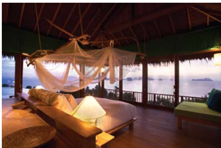
Hill Top Reserve Master Bedroom