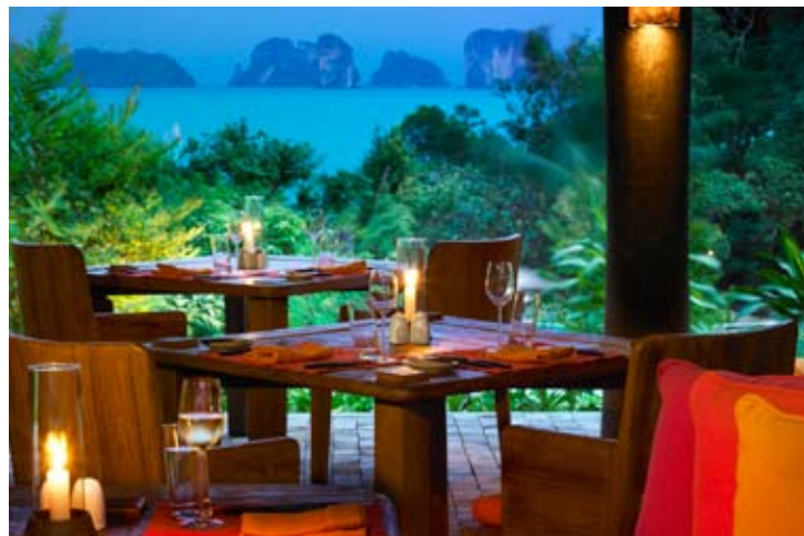
The Living Room

Close to the beach, this all-day dining choice offers alfresco or undercover seating. The Living Room is constructed from traditional material such as timber flooring, coconut palm columns and classic thatching overhead. Offering tempting buffets at breakfast and dinner, it also showcases an open cold-kitchen and patisserie, into which guests are invited to wander in and help themselves. The Living Room also presents a marriage of world cuisine, with tandoori and pizza ovens, and an open grill. It truly is a feast for the eyes and the taste buds, as guests choose from everything on offer, and join the specialty world cuisine evenings, watching dishes being prepared. The atmosphere is very relaxed, with large comfortable seating areas offering booths and banquettes, and extending to the outdoor Terrace. There are also several outdoor dining pavilions.