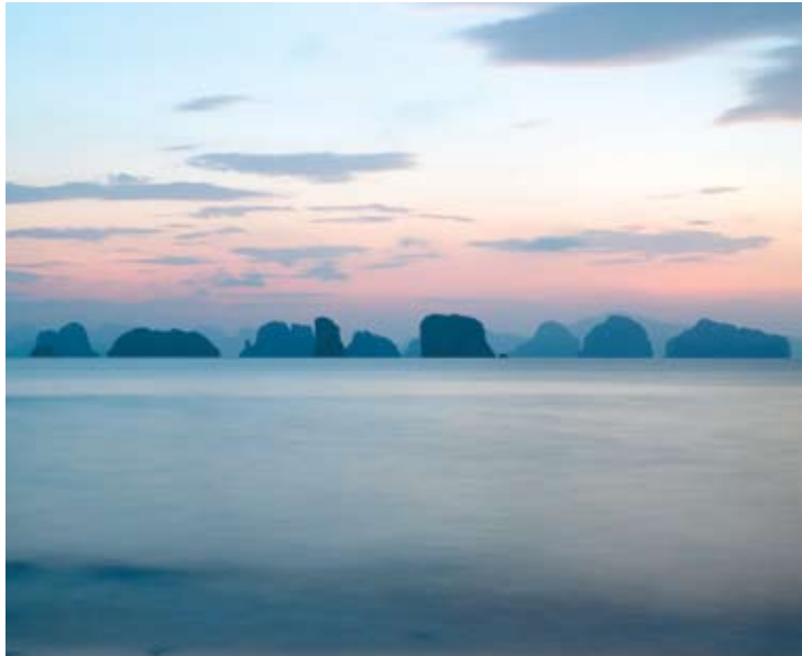
Phang Nga Bay

Six Senses Hideaway Yao Noi is located on the Island of Yao Noi, situated midway between Phuket and Krabi, among the awe-inspiring limestone pinnacles of Phang Nga. Traveling time from the airport from Phuket is around forty five minutes to one hour by motor boat, or 15 minutes by helicopter service.