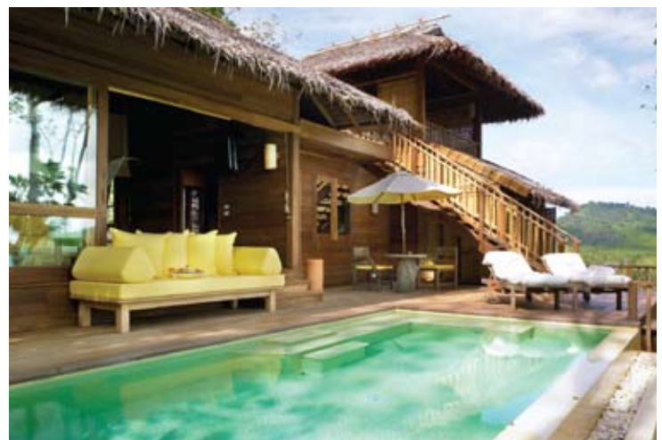
Deluxe Pool Villa